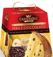
PANETTONE POIRE & PÉPITES CHOCO PUR BEURRE COFFRET 750G/6UVC 40C/PAL