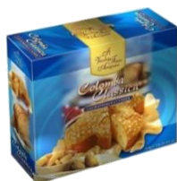
COLOMBE CLASSIQUE COFFRET 900G/11UVC 16C/PAL