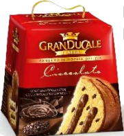
PANETTONE PÉPITES & CRÈME CHOCOLAT PUR BEURRE COFFRET 750G/6UVC 40C/PAL