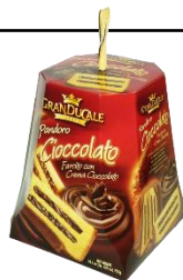
PANDORO CHOCOLAT COFFRET 750G/12UVC 16C/PAL