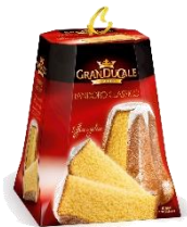
PANDORO CLASSIQUE COFFRET 900G/9UVC 16C/PAL