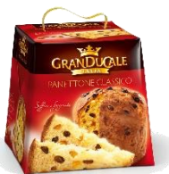
PANETTONE PUR BEURRE COFFRET 900G/12UVC 20C/PAL