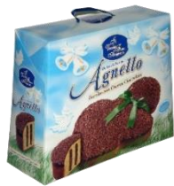
AGNEAU CRÈME CHOCOLAT COFFRET 750G/11UVC 16C/PAL