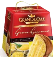
PANETTONE CITRON PUR BEURRE COFFRET 750G/6UVC 40C/PAL