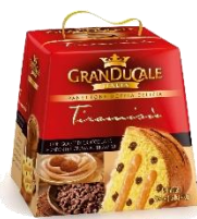
PANETTONE TIRAMISU PUR BEURRE COFFRET 750G/6UVC 40C/PAL