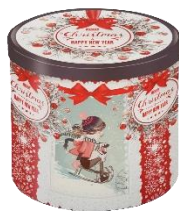
PANDORO PUR BEURRE BOITE FER 750G/8UVC 20C/PAL