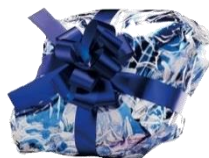
COLOMBE PUR BEURRE EMBALLÉE MAIN 900G/7UVC 24C/PAL