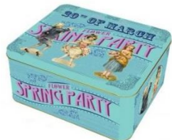
COLOMBE CLASSIQUE BOITE FER 700G/12UVC 16C/PAL