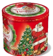
PANETTONE PUR BEURRE BOITE FER 1KG/6UVC 40C/PAL