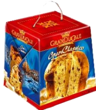
PANETTONE CLASSIQUE COFFRET 900G/6UVC 40C/PAL