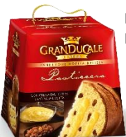
PANETTONE RAISINS SECS & CRÈME PÂTISSÈRE PUR BEURRE COFFRET 750G/6UVC 40C/PAL