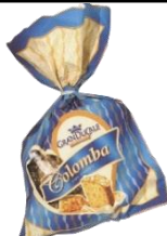
COLOMBE CLASSIQUE CELLOPHANE 700G/4UVC 60C/PAL