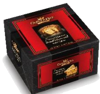
PANETTONE PUR BEURRE BOITE A OFFRIR 1KG/6UVC 40C/PAL