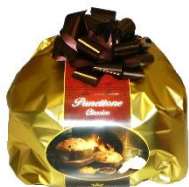
PANETTONE PUR BEURRE EMBALLÉ MAIN 1KG/9UVC 24C/PAL